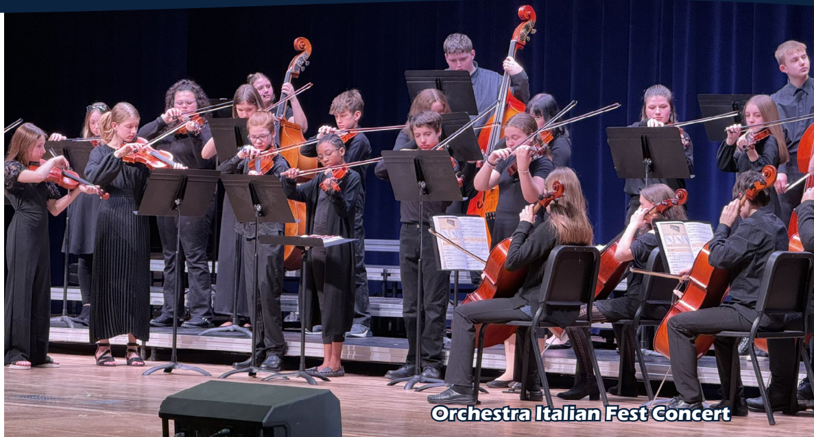
Orchestra Italian Fest Concert