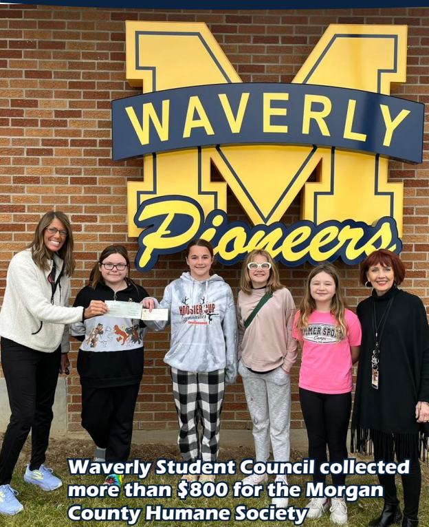
Waverly Student Council collected more than $800 for the Morgan County Humane Society