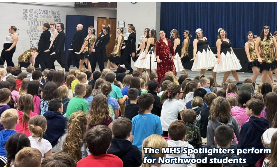
The MHS Spotlighters perform for Northwood students