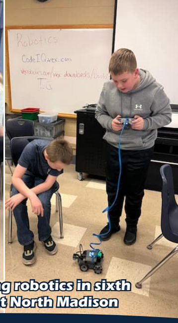
Studying robotics in sixth grade at North Madison