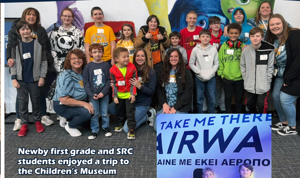
Newby first grade and SRC students enjoyed a trip to the Children's Museum