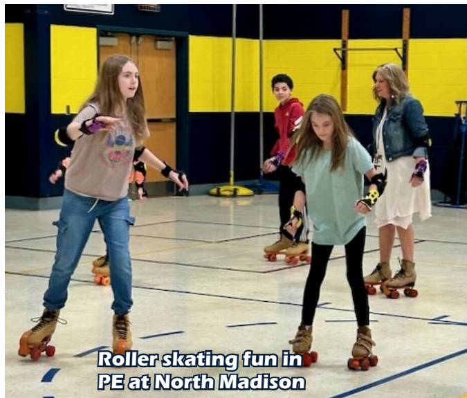
Roller skating fun in PE at North Madison